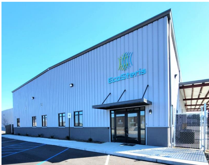
EcoSteris facility at 112 Fabricators St. Summerville, SC.

An innovative medical waste management company that specializes in providing environmental and healthcare integrated waste treatment and disposal solutions using clean sustainable technology that meets strict national and international safety standards and regulations.